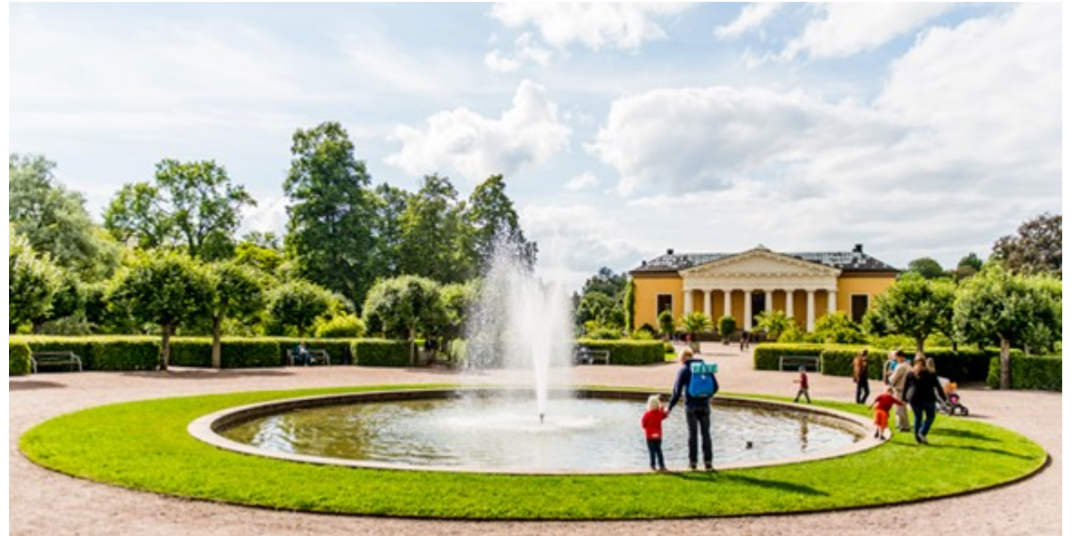
Uppsala Botanical Garden